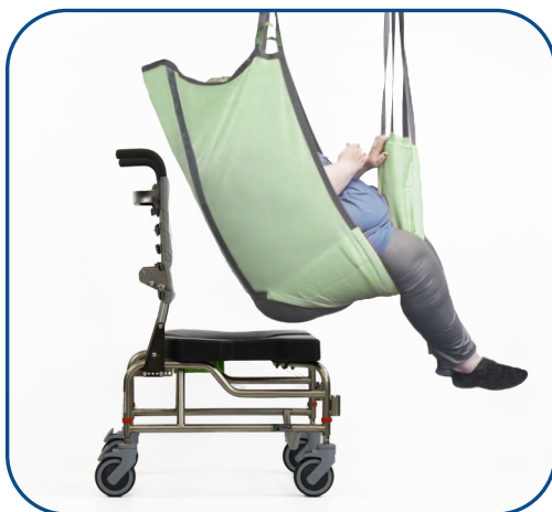
Transferring Into a Non-Tilting Chair