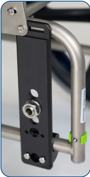
Adjustable Axle Plate