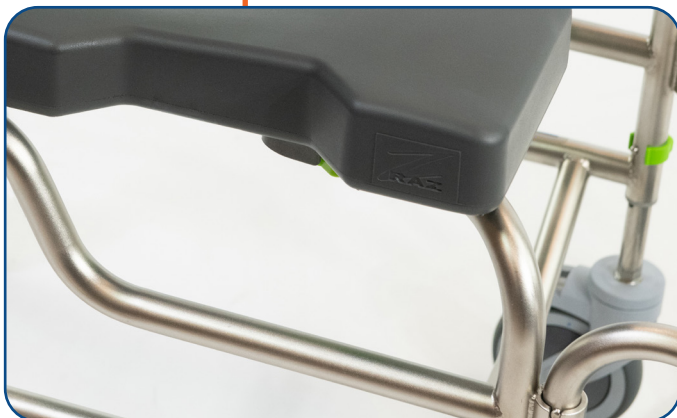
Unrestricted Side Access

Recessed, dipped front cross tube allows for better toilet bowl access and facilitates standing-pivot transfers