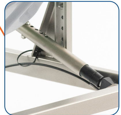
Pressurized Gas Struts