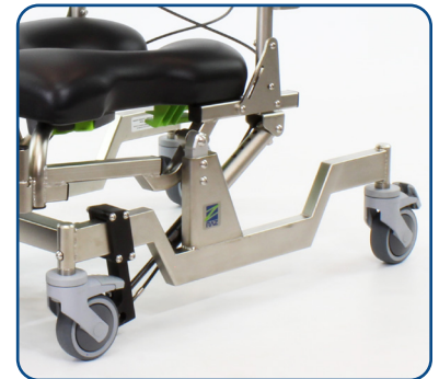
Super-Low AT (5" lower)