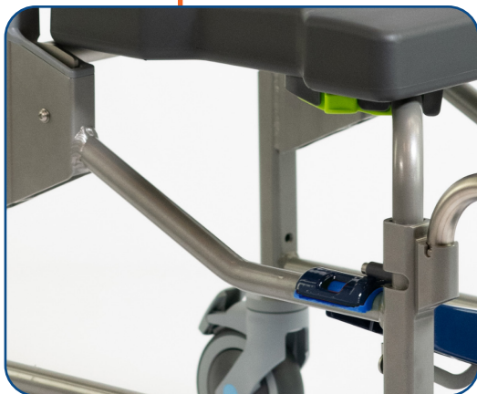
Unrestricted Side Access

Designed with a forward arch and low pivot point to allow the Züm to be positioned fully over a toilet