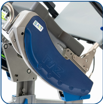
Patented, Dual-Arc Tilt Geometry

Maintains a near-constant location of the center of mass (CoM), which greatly reduces tilt effort.