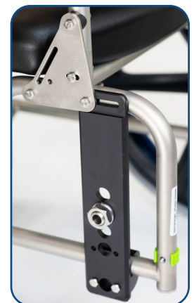
SP Axle Plate

Our design philosophy centers around the principle of modularity. Raz MSCCs can be configured to accommodate the client's medical condition and functional needs.