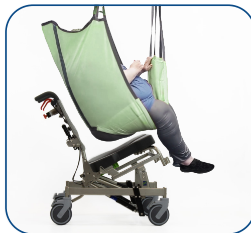
Transferring Into a Raz-AT600

The tilting feature of the Raz-AT600 allows for safer transfers when using a mechanical lift. The image above left shows a transfer into a non-tilting chair, which results in the client perched on the front edge of the seat. This is a potentially dangerous situation that can be avoided by using a pre-tilted AT600. Also, having the client on a tilted seat facilitates repositioning.