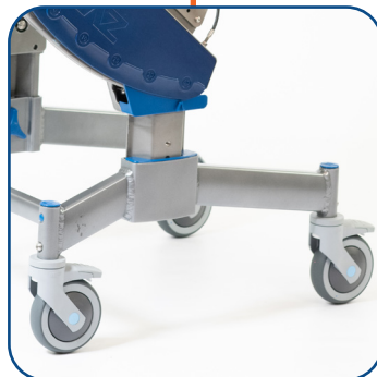
Invertible Base – High Range (24"-27")