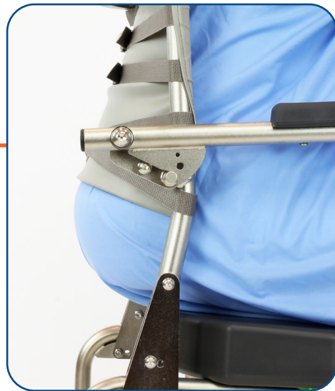
Gluteal Shelf Accommodation

Lower bend in back canes and tension-adjustable upholstery are standard on all Raz bariatric chairs.