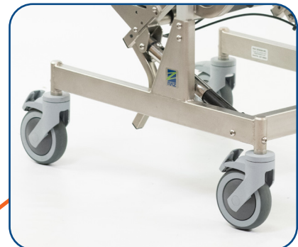
3" shorter base frame length vs. Raz-AT