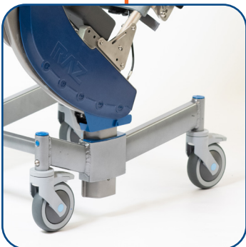
Invertible Base – Low Range (20"-23")