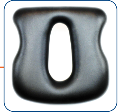
Standard CAT Seat

Tapered, oblong aperture (3.5"W at front and 4.5"W at rear). Aperture width increases as the seat depth increases.